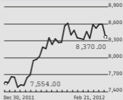
LME Copper ($/tonne)