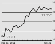
LME Silver Spot ($/Oz)

Performance of various metals and crude oil in the last two months